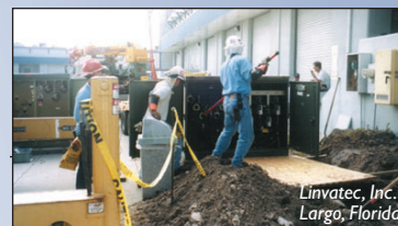
Linatec, Inc. Largo, Florida