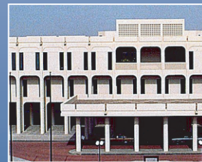
Qaboos University Teaching Hospital. 500-bed facility covering 10 multi-story buildings, which forms part of a 5,000-student university campus.